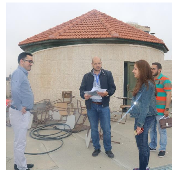
Facilities team begins planning for summer projects early during the year.

Our 2 nd annual Alumni Reunion will take place at the Lower Campus this year on Friday July 13 th , 2018. If you are an RFS alumni or Attendee, please join us for a chance to reconnect with your school teachers and friends.*