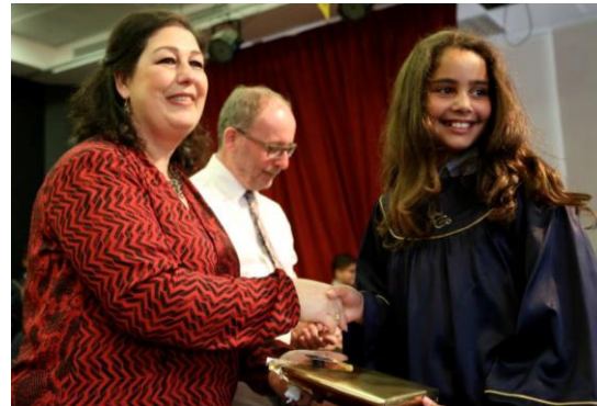
5th Grade Farewell Ceremony May 2018

Through our engaging and giving programs, essential attributes are instilled in each member of the community. Great stewards are conscientious and empathetic taking responsibility for their decisions. Good citizenship and stewardship require that each human lives and strives to make this world a better place. Here at our beloved Friends School, we are making this world a better place!*