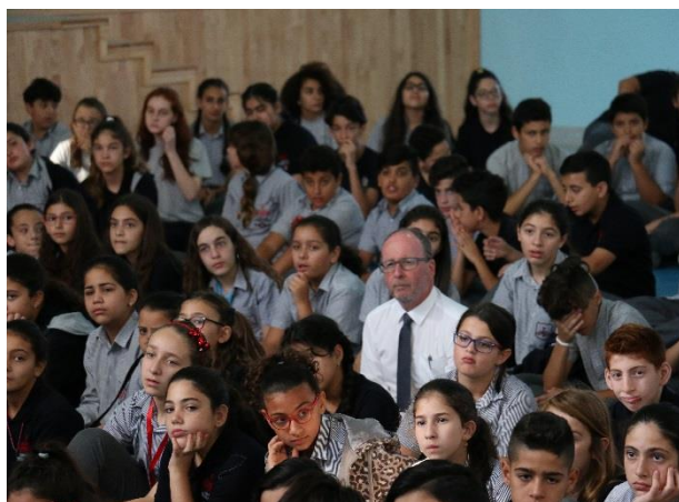
Middle School's first Silent Meeting