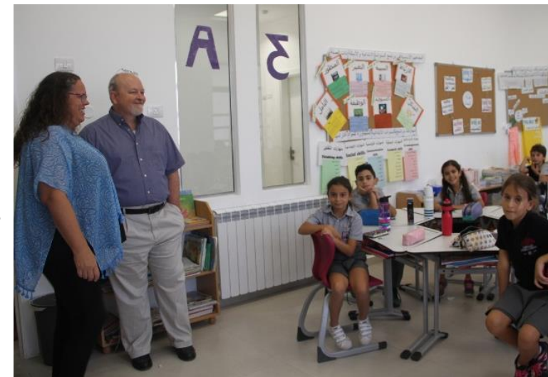
FUM delegation meets 3rd graders in their new classrooms

FUM believes that a good education is one of the best approaches to rooting Quaker values in any community.