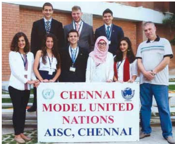
RFS students attending the MUN conference in India

So what does this incident say about our students?