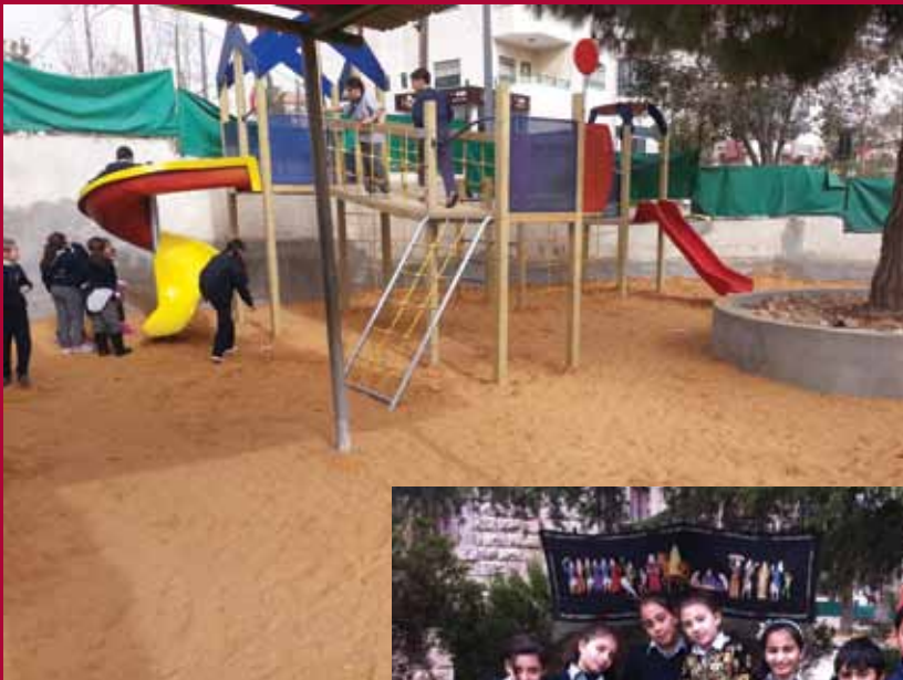
Above: The new playground at the Lower School

Non-Profit Org. U.S. Postage PAID Richmond IN Permit No. 747