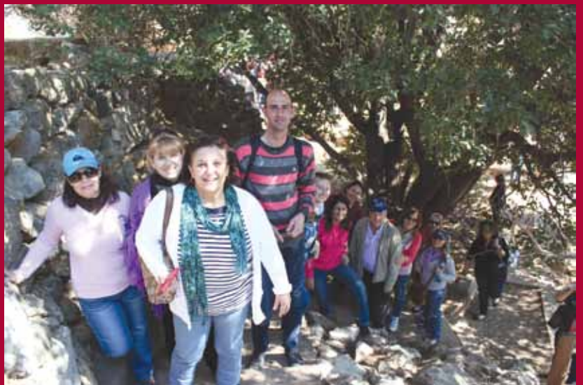
Lower school teachers during their school trip to Golan Heights