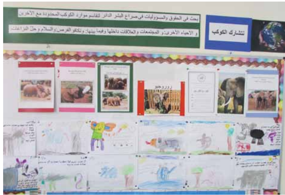
A poster created by kindergarten students about Rorogio

The children did not stop with adopting Rorogio. They are now engaged in conversations with their teachers, families and school partners on how to support a local zoo in Qalqilya, Palestine. Such opportunities for children to know and care for their world are pivotal to us here at the kindergarten of Ramallah Friends Schools. Our children recognize that these opportunities are important to their commitment in solving problems, and that it is possible for them to care for humans, animals and the planet.