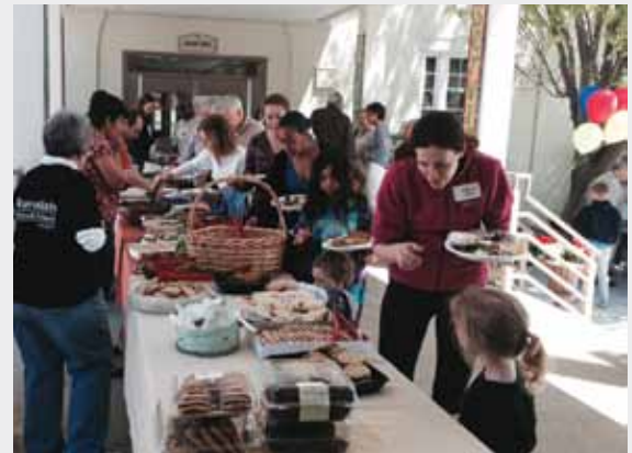
Bethesda Monthly Meeting's Spring Fling to raise money for scholarships of Ramallah Friends Schools