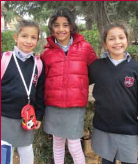
Lower school students at their break time