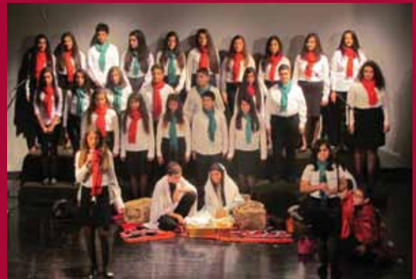
Above: RFS choir singing at the Christmas Carols evening