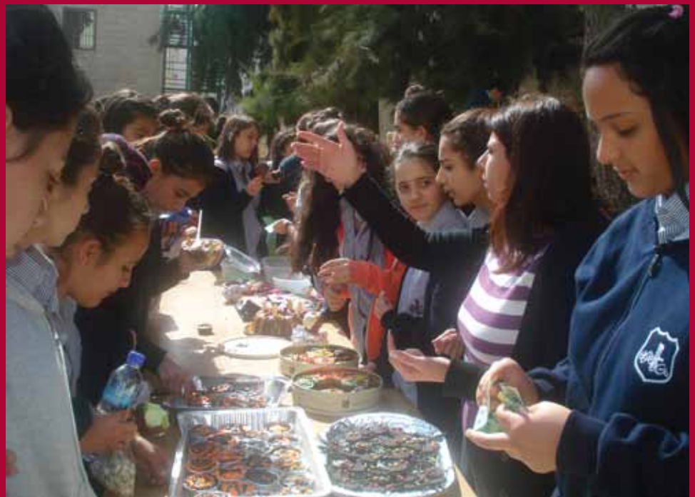
Bake sale at the Upper School

The school's white gifts committee managed this year to raise over US $6000 during the months of November and December through bake sale and other fundraising activities. The money was then donated to charitable organizations and some families who are in need.