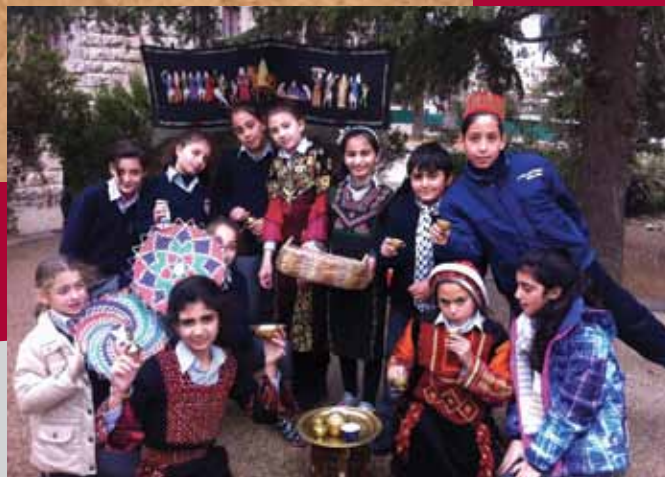
Right: Fourth graders at the lower school wearing the Palestinian national costumes during one of their projects