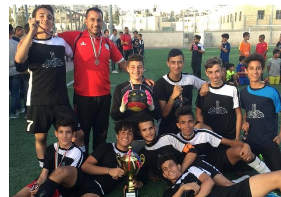
Part of Afterschool programs, the Middle School soccer team won the Ramallah District Football Championship in October.

At RFS, we encourage students to take part in as many extracurricular programs and activities as they would like because we view it as an opportunity for them to develop new interests and learn new skills. This is part of the School's responsibility as a learning environment that provides students with choices that they can make voluntarily and independently.